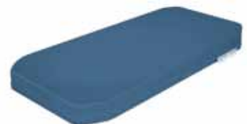
Blue Promust PUHD