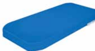
Blue Promust PU